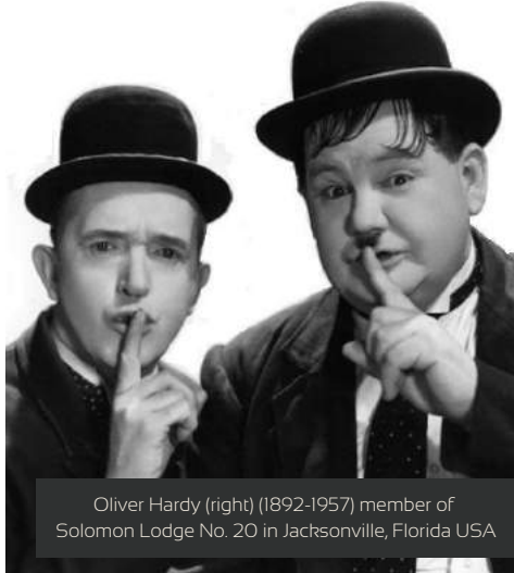
Oliver Hardy (right) (1892-1957) member of Solomon Lodge No. 20 in Jacksonville, Florida USA

Grand Lodges and other Masonic bodies that do not meet these standards, e.g. that do not require a belief in a Supreme Being, or that allow or encourage their members to participate in political matters, are not recognised by United Grand Lodge as being Masonically regular, and Masonic contact with them is forbidden.